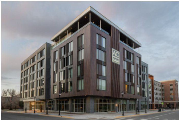
AC Hotel Downtown Bozeman