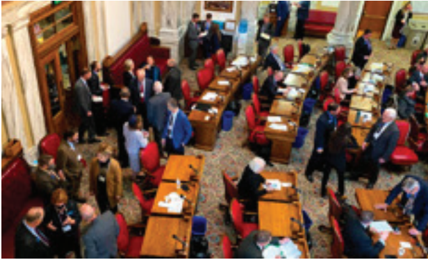
House GOP members caucus ahead of the 2021 Session (photo credit: Eric Dietrich, Montana Free Press).

The rate applies to income attributable to the sale or exchange of stock as a result of employment or service as a director of a qualifying Montana corporation. The corporations must meet certain Montana tenure and employment conditions to be eligible for the rate. This incentive, with appropriate sideboards to make it Montana-centric, is a creative approach to attracting entrepreneurs who might otherwise invest elsewhere. SB 184 passed 33-17 in the Senate and 66-30 in the House. Governor Gianforte signed the bill. This vote is worth 5 points.