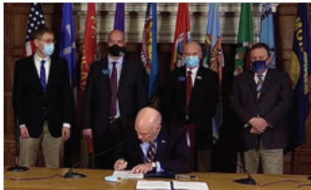
Governor Gianforte signs into law SB 65, COVID liability protections. (L to R): Sen. Fitzpatrick, Speaker Galt, Rep. Noland, and President Blasdel look on.

HB 629 incentivizes high-wage job creation in Montana. Businesses in select industries that hire a certain number of new employees, depending on the location of the business, are eligible for a tax credit equal to 50% of the U.S. federal payroll tax (3.825% of the wages or salary of each qualifying employee hired). The minimum qualifying wage per employee is $50,000. A multi-industry approach to encourage wage growth, HB 629 passed 74-26 in the House and 37-13 in the Senate. Governor Gianforte signed the bill. This vote is worth 5 points.